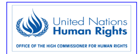
United Nations Office of the High Commissioner Human Rights (OHCHR)

Working for Women's Empowerment and Gender Equality