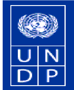
United Nations Development Programme (UNDP)