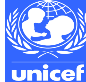
United Nations Children's Fund (UNICEF)